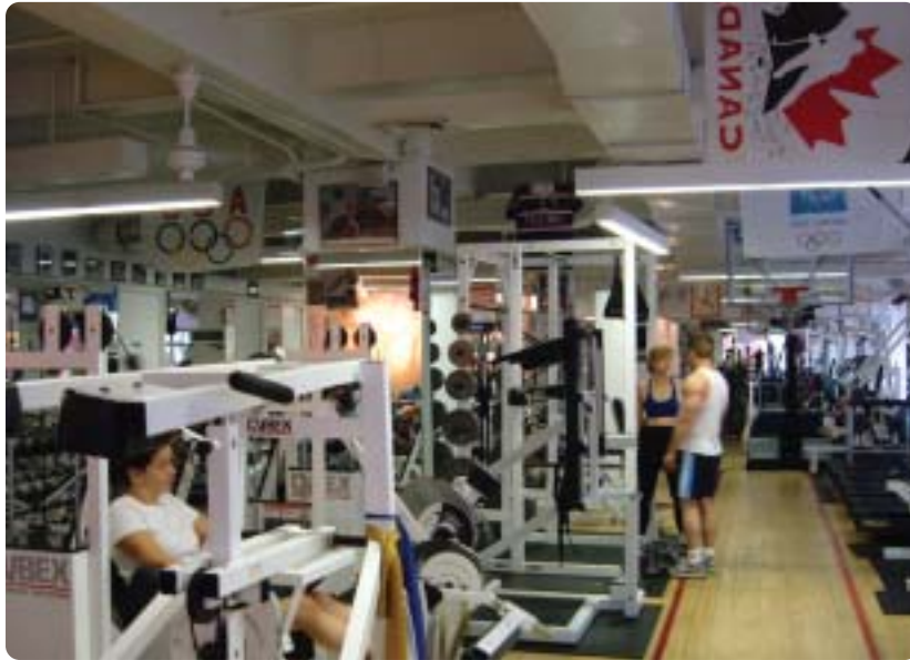
After installing a JBL sub at the U.S. Athletic Training Center for last month's report, further adjustments were made with RPG's new Clearisorber.

In the lucky circumstance of designing before construction, the room is the first parameter that needs to be taken into consideration. What are your goals? The spoken word, boardroom presentations, live stage acts and post-production voiceover studios all have different object sound curves to strive for. OS-